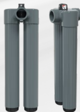
6 Models Between 1550 m 3 /h - 5400 m 3 /h